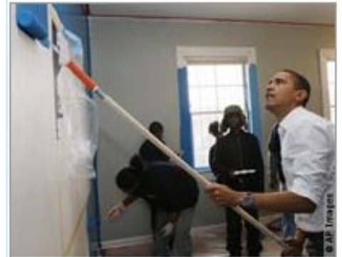
Barack Obama takes part in a renovation of a homeless shelter for runaway teenagers in Washington on January 19.

Obama and King's son, Martin Luther King III, volunteered at a homeless shelter for teens in Washington. "This country is great because of its people. And when all of our people are engaged and involved in making the community better ... we can accomplish anything," Obama said as he helped paint the shelter's walls.