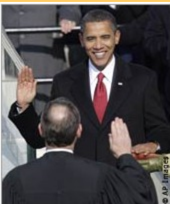
Chief Justice John Roberts administers the oath of office to Barack Obama, the 44th president of the United States.

In 1950's America, the equality of man envisioned by the Declaration of Independence was far from a reality. People of color — blacks, Hispanics, Asians — were discriminated against in many ways, both overt and covert. The 1950's were a turbulent time in America, when racial barriers began to come down due to Supreme Court decisions, like Brown v. Board of Education ; and due to an increase in the activism of blacks, fighting for equal rights.